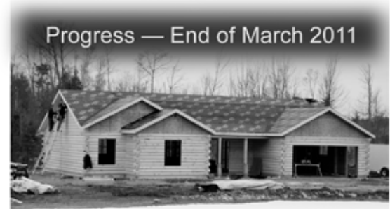
Progress — End of March 2011